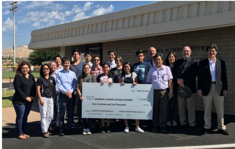
Students from the Morenci district and people from the SMM Scholarship Fund