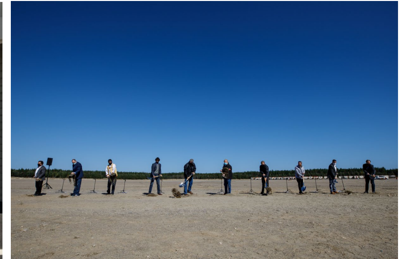
Ground-breaking ceremony of Cote Gold Chiefs of First Nation joined