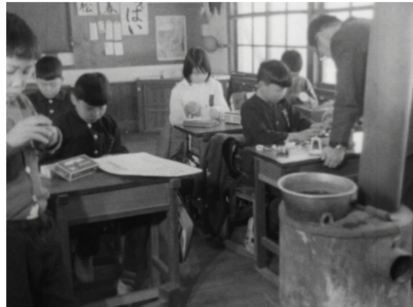
Sumitomo Tonaru Private Elementary School