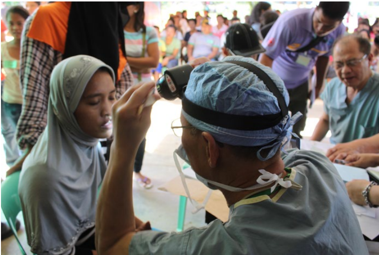
Free medical care for local residents (The Philippines)