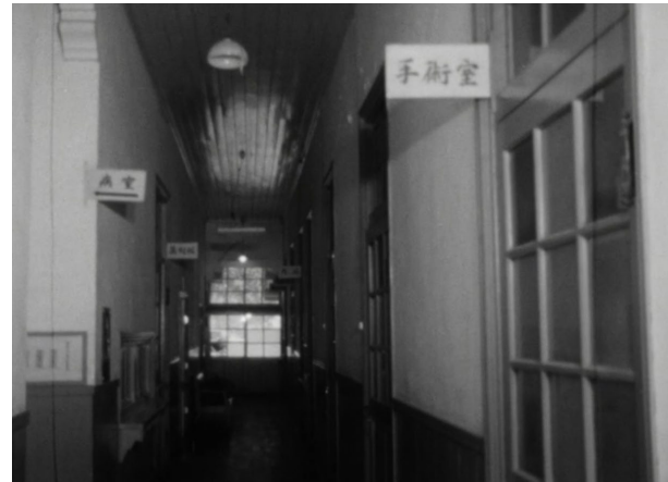
Sumitomo Besshi Hospital, Tonaru Branch

1967, Besshi Copper Mine, Tonaru District